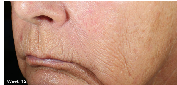
Images were captured and analyzed by using Clarity 2D Research System