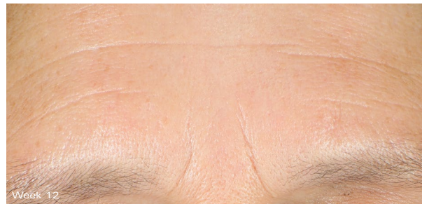
Images were captured and analyzed by using Clarity 2D Research System